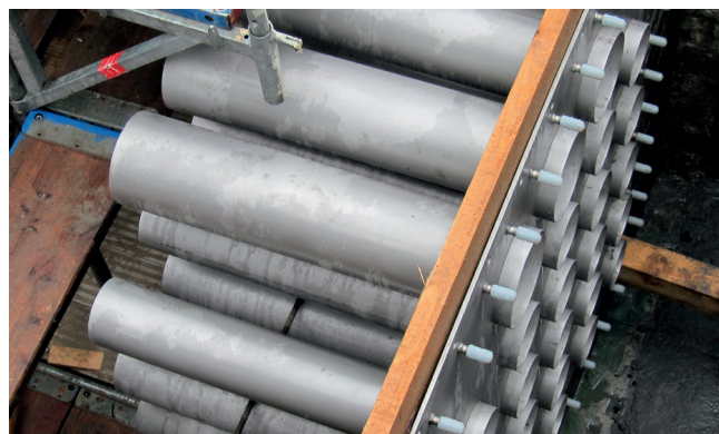
Multiple stainless steel wall sleeve HRD-FUF/o/u

During construction of the North-South City Train in Cologne at the station Heumarkt (construction time starting in 2007) it was required to seal cable duct systems passing through the tunnel ceiling (with waterproof sheeting) pressure tight. For this requirement we developed a tailor made stainless steel fixed and loose flange solution, type multiple stainless steel wall sleeve HRD. This specific multiple flange with annular space sealings offers an ideal pressure tight solution for the ceiling with waterproof sheets according to DIN 18195 part 9.