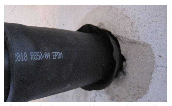
Following creation of an empty conduit route (DA 63) using a soil displacement rocket, the building entry is pushed into the core drill hole via the driving pipe.