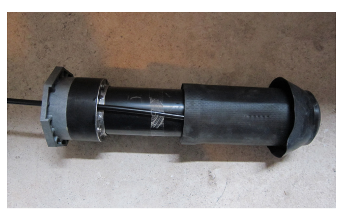
Adaptation of the building entry to the on-site conditions: cutting to length and adaptation to wall thickness. Sealing is achieved through injection of a 2-component resin via a filling hose.