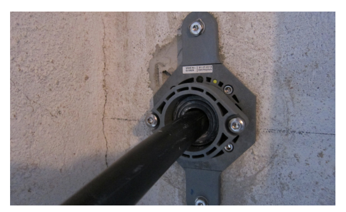
Final installation and resin-filled building entry with mechanical fixation and sealing element for electricity. Suitable for water or electricity media lines up to DA 50. Same sealing element design as for Hauff multi-line building entry.