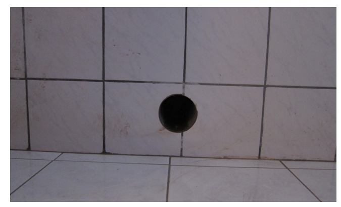
Refurbishment of building connections in existing buildings. Difficult conditions due to different basement constructions and construction materials. Making a core drill hole of 99-103 mm.