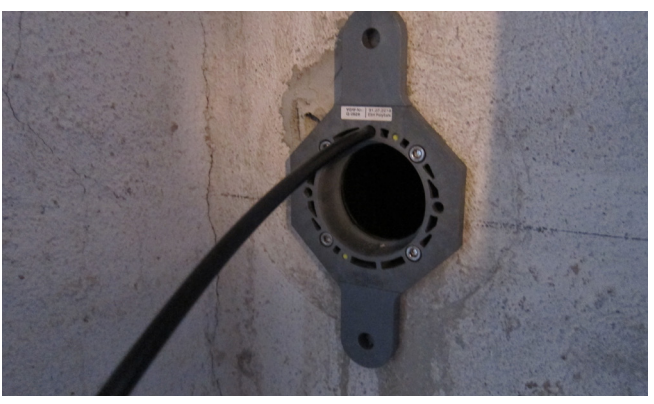
Fully inserted single building entry for trenchless construction with attachment tabs (mechanical fixing to poor-condition brickwork) prior to resin filling.