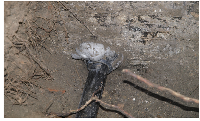
Inspection opening on outside of building: the completely escaped/partially exuded resin under the shield enables the integration of pre-existing surface sealing where applicable.