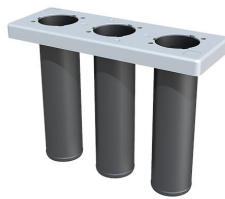
Seal insert for basic insert