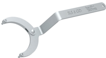
Flexible socket wrench