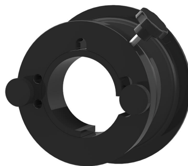
Quick tensioning device MIS