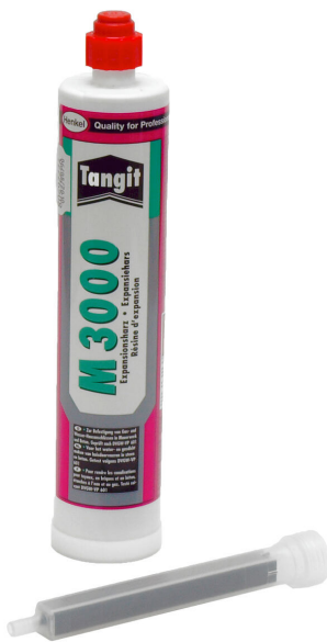
2-component resin M3000