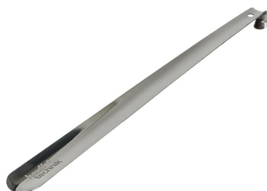
Assembly plate for fire-stop pads