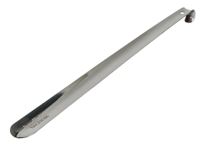
Assembly plate for fire-stop pads