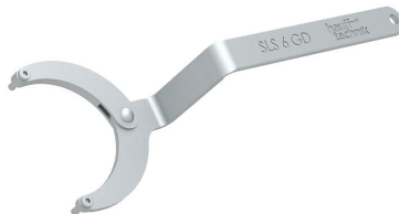
Flexible socket wrench