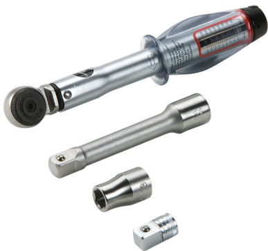
Toolset for KES-M