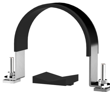
Fastening bracket 160