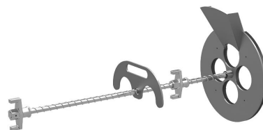
Compound injection unit