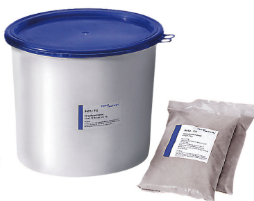
Hauff - Beto - Fix void-filling mortar