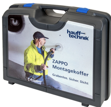
ZAPPO assembly kit