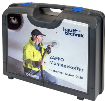
ZAPPO assembly kit