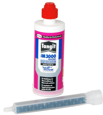
2-component resin iM3000