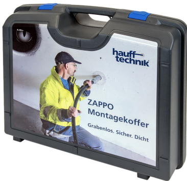
ZAPPO assembly kit