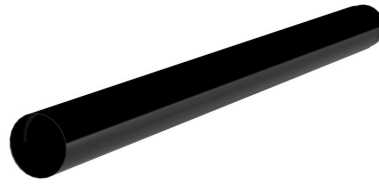
ZAPPO driving pipe