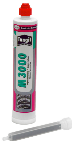
2-component resin M3000