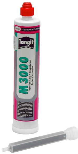
2-component resin M3000