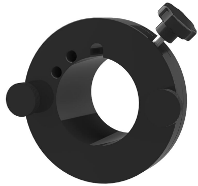
Quick tensioning device