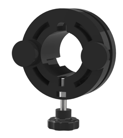
Quick tensioning device