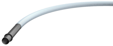
Spiral hose system