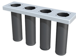
Seal insert for basic insert