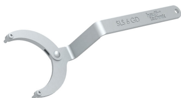
Flexible socket wrench